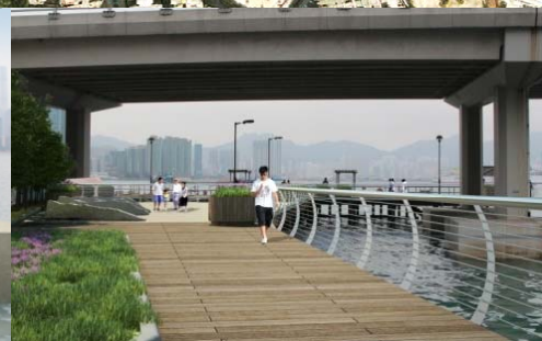
Artist's Impression at Tong Shui Road