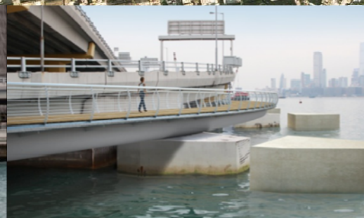
Artist's Impression near Tong Shui Road Pier