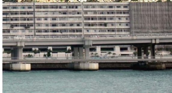
Artist's Impression near Provident Centre

通往現有鯽魚涌海濱花園 To existing Quarry Bay Promenade