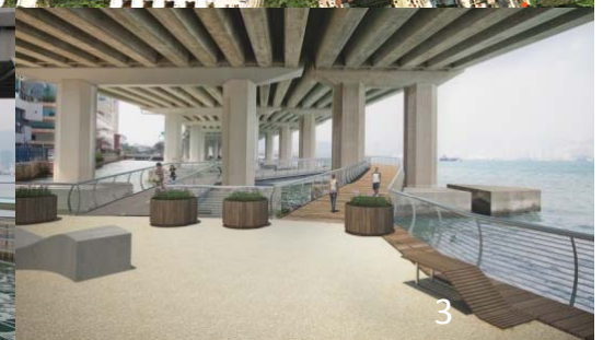
Artist's Impression at Hoi Yu Street Access Point