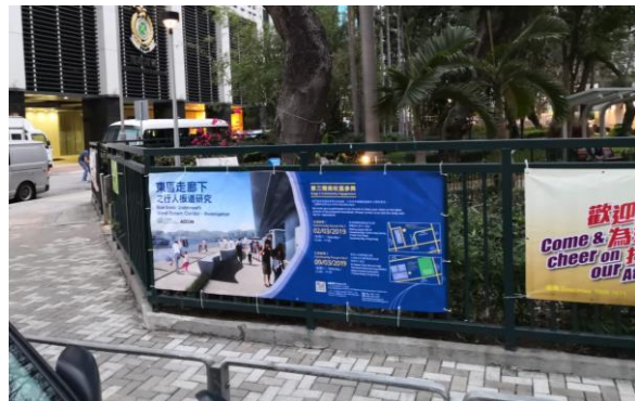
King's Road Playground