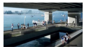
和合中心外 Outside President Centre