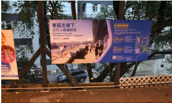
Fortress Hill Road Playground