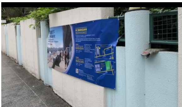
Pak Fuk Road Playground