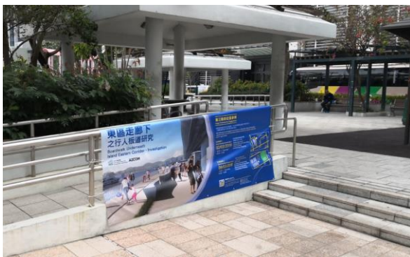
Tin Chiu Street Children's Playground