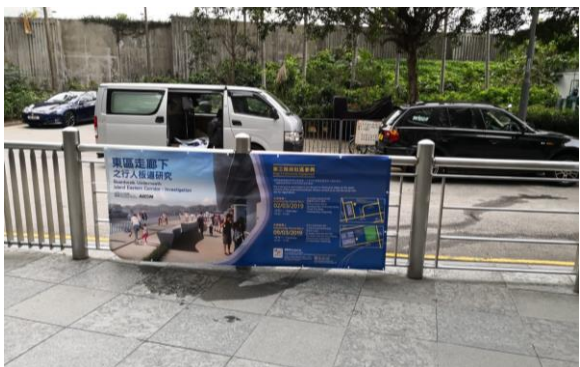
Quarry Bay Park