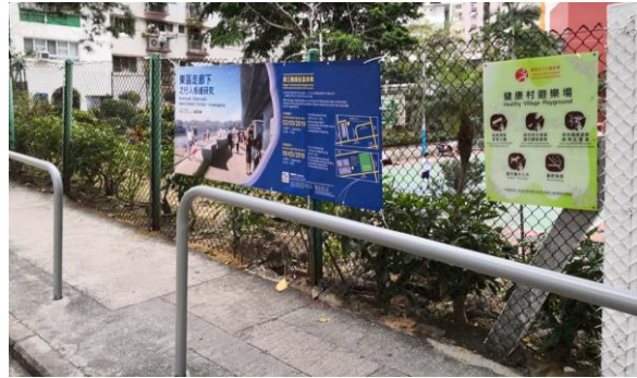
Healthy Village Playground