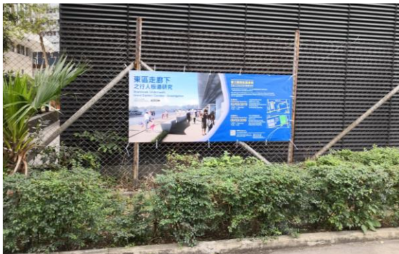
Java Road Playground