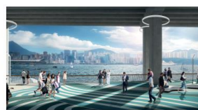
海傍街出入口 Access Point at Hoi Yu Street