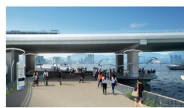
離水邊通往釣魚平台 Tong Shui Road towards Fishing Platform