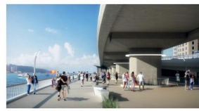
利達大廈外 Outside Kodak House