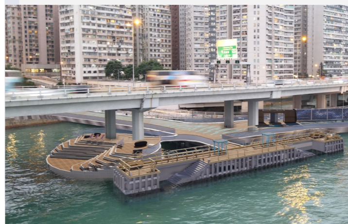
釣魚平台 (Fishing Platform)