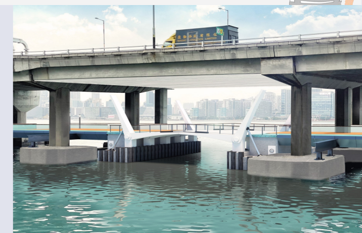
開合橋 (Movable Bridge)