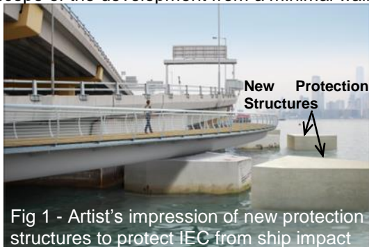
Fig 1 - Artist's impression of new protection structures to protect IEC from ship impact

This feedback form is designed to assess the level of acceptance by the public as to whether there is a compelling and present need for the boardwalk. It is intended to assess the needs across several aspects, including public health, environment, accessibility, economic and social development. It also examines community response to the scope of the development from a minimal walkway to one that includes a cycleway and other leisure options.